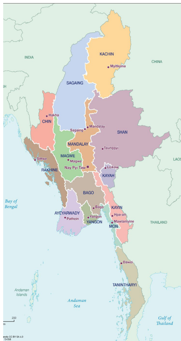
Figure 2: Map of Myanmar's States and Regions